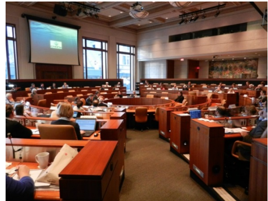
The “Path forward” panel discussion amongst scientists, politicians and conservationists.

CHONe will produce a convenor’s report in January 2014 and will work with participants on action items arising from the meeting to ensure that the vision and ideas shared in Vancouver are not lost.