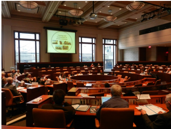
The student panel discussion ("The next generation of scientists on why we care").

NSERC's Canadian Healthy Oceans Network (CHONe) hosted a two-day 2020 Vision of Canada's Oceans Dialogue on the future of Canada's oceans.