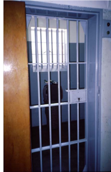
The cell in the Robben Island prison in which Nelson Mandela lived for 18 of his 27 years in prison.