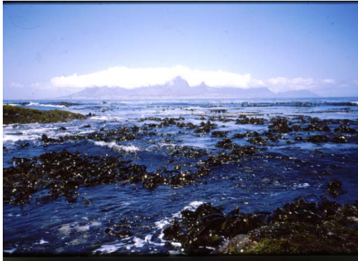
The population of the kelp, Ecklonia maxima , harvested by Nelson Mandela. In the background, Table Bay, Cape Town and Table Mountain (photo credit: Thierry Chopin, who visited Robben Island in January 2001, before attending the 17th International Seaweed Symposium in Cape Town, South Africa).

"One morning, instead of walking to the quarry, we were ordered into the back of a truck. It rumbled off in a new direction, and fifteen minutes later we were ordered to jump out. There in front of us, glinting in the morning light, we saw the ocean, the rocky shore, and in the distance, winking in the sunshine, the glass towers of Cape Town. Although it was surely an illusion, the city, with Table Mountain looming behind it, looked agonizingly close, as if one could almost reach out and grasp it.