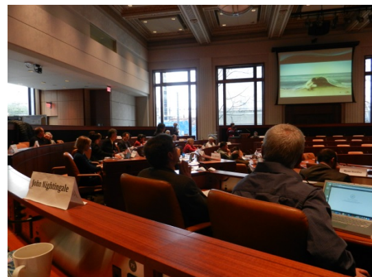
During the presentation of Isabelle Côté (Simon Fraser University), entitled "Looking below the ocean surface: the Good, the Bad, and the Ugly".