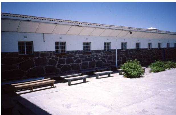
The prison yard at Robben Island.