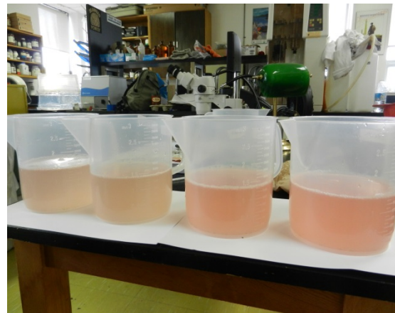
Jars containing solutions of tetraspores released from mature tetrasporophytes of the red alga Palmaria palmata.

Reproductive tetrasporophytes and male gametophytes can be identified by the presence of sori, paler in male gametophytes than in tetrasporophytes and with single gametes instead of the tetrad arrangement of spores. Constanza has been monitoring the timing of the occurrence of male gametophytes and tetrasporophytes on a year-round basis. She has also developed protocols for the massive release of spermatia ( i.e. the sexual male gametes) and tetraspores ( i.e. the asexual spores). Presently, Constanza is defining the laboratory conditions and methods for cultivating the different phases of P. palmata before their transfer to IMTA sites.