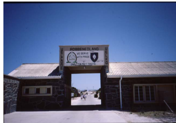
The entrance of the Robben Island prison (photo credit: Thierry Chopin).

The work did not seem too taxing to us that day, but in the coming weeks and months, we found it could be quite strenuous. But that hardly mattered because we had the pleasures and distractions of such a panoramic tableau: we watched fishing ships trawling, stately oil tankers moving slowly across the horizon; we saw gulls spearing fish from the sea and seals cavorting on the waves; we laughed at the colony of penguins, which resembled a brigade of clumsy, flat-footed soldiers; and we marveled at the daily drama of the weather over Table Mountain, with its shifting canopy of clouds and sun.