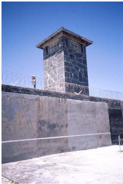
One of the Robben Island prison towers.